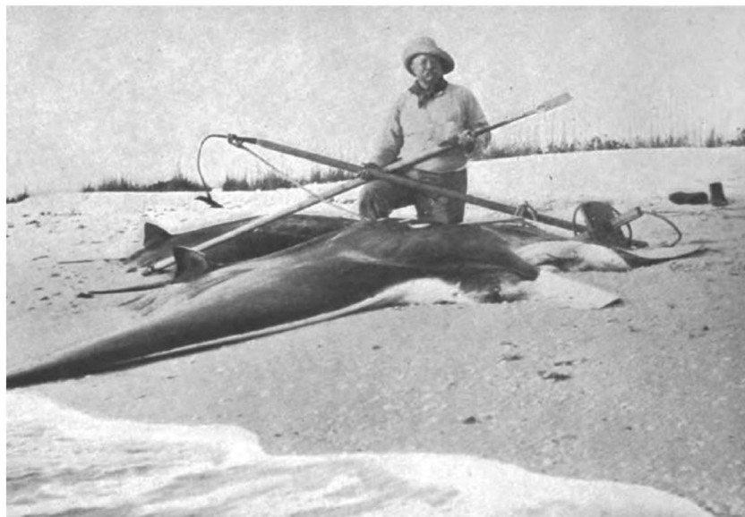
Figure 1. US President Theodore Roosevelt with Manta birostris harpooned recreationally off Florida in 1916 (Roosevelt, 1917).

Targeted mobulid harpoon fisheries have been documented across Indonesia including Lombok, Lamakera, Lamalera, and villages in the Alor region (Dewar, 2002; White et al. 2006a, A. Marshall, pers. obs.). Most have existed for